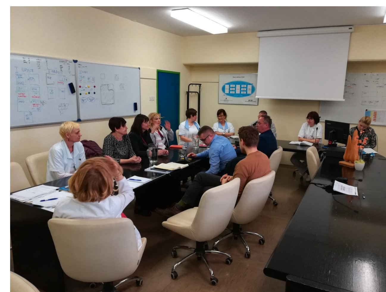
Picture 2 Meeting of the Local implementation working group in Novo mesto, Slovenia