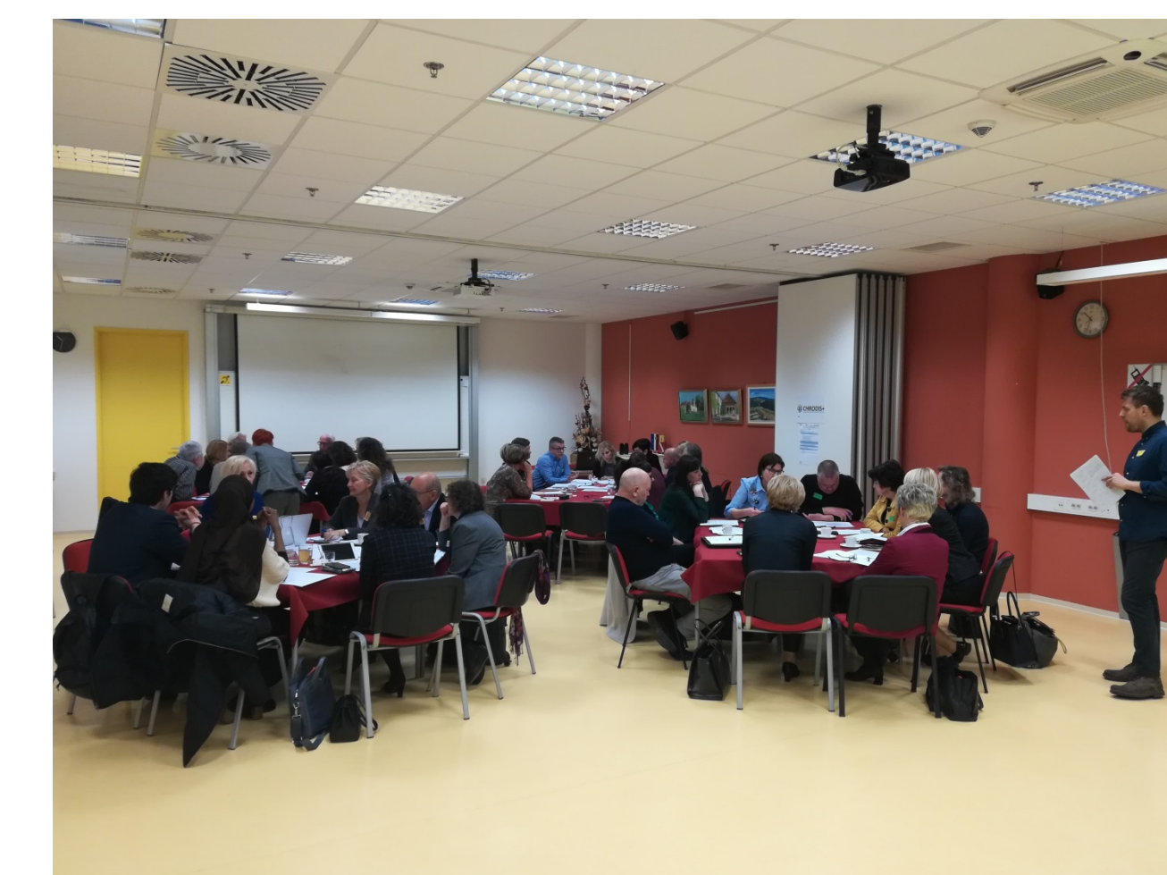
Picture 3 Gathering of the local stakeholders (municipality, general hospital, community health centre, Centre for social service, NGOs) decision-makers (MoH, National insurance institute), patient representatives and international Chrodis+ Study visit group in Novo mesto, Slovenia