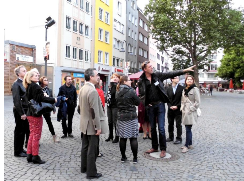
Practical example for the promotion of physical activity among public health experts: Walking tour in Cologne