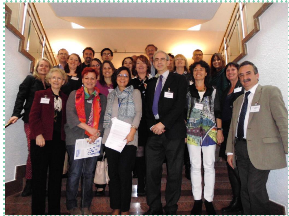
Participants of the Work Package Meeting in Cologne